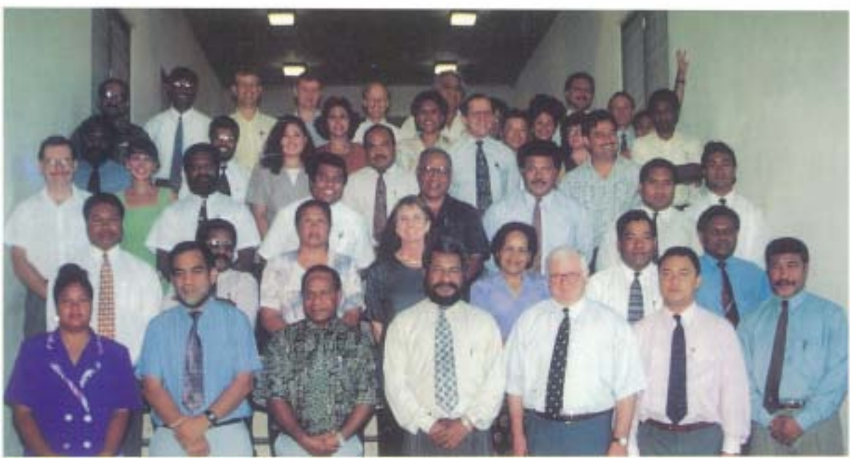
1996 Forum officials committee.