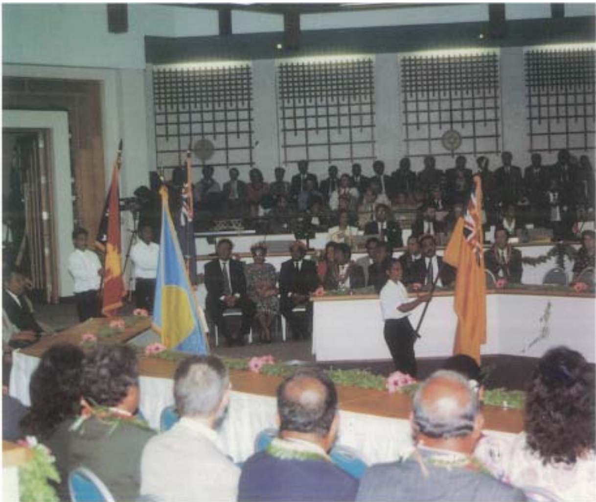
1996 Forum session in Majuro, Republic of Marshall Islands.

Another area of work gaining prominence under the new Secretariat mandate is providing policy support to the South Pacific Organisations Coordinating Committee (SPOCC) which, in 1996/97, included preparing for and servicing two full SPOCC meetings and two Working Group meetings; participation in task forces of other SPOCC agencies; and on-going coordination of SPOCC inputs into the Forum process and other key regional and international processes.