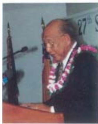
The late President of the Republic of Marshall Islands & Chairman of the South Pacific Forum, HE Amata Kabua, at the opening of the 1996 South Pacific Forum meeting in Majuro, Republic of Marshall Islands.

Coordination of arrangements for the Forum is a major task, undertaken in close consultation with the host (Republic of Marshall Islands for 1996, Cook Islands for 1997)