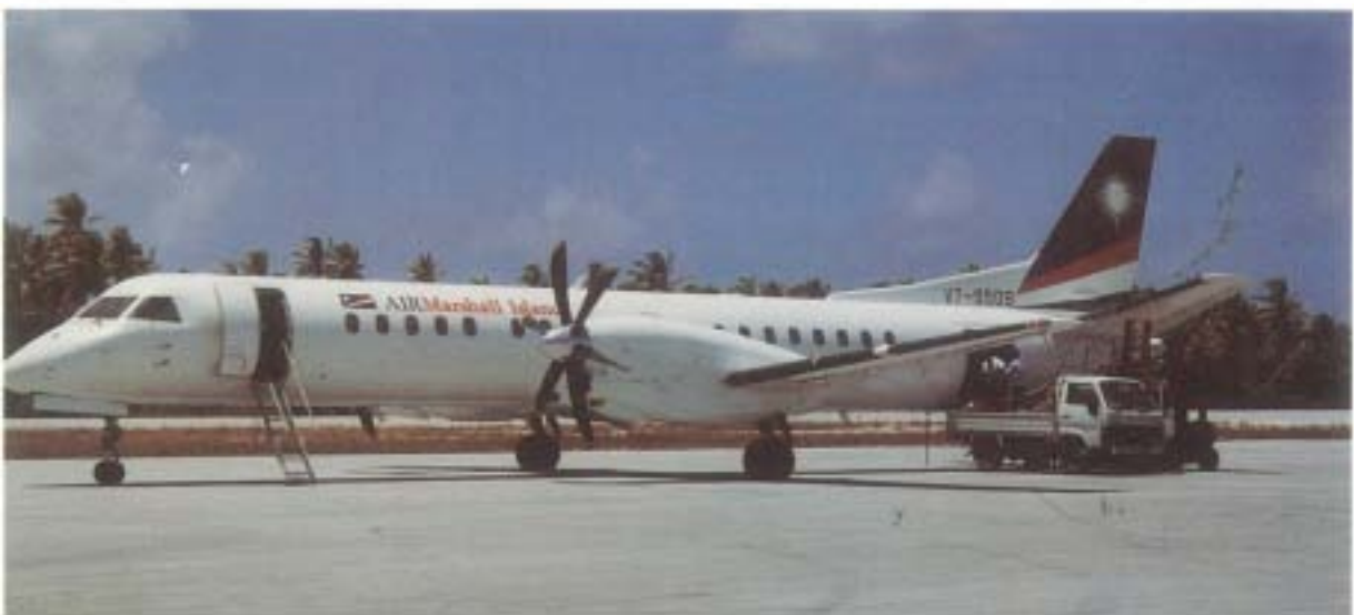
Air Marshall Islands

Telecommunications Division ceased operations in the reporting year following the Regional Telecommunications Committee Meeting held on 25 September 1996 in Suva. Regional coordination of telecommunications business issues is being encouraged through the Pacific Islands Telecommunications Association (PITA), which held its first General Meeting in April 1997. Liaison with the International Telecommunications Union; Asia-Pacific Telecommunity; Pacific Telecommunications Council; and APEC Telecommunications Working Group and national agencies continued in 1997 through the Development and Economic Policy Division in order to address continuing policy issues.