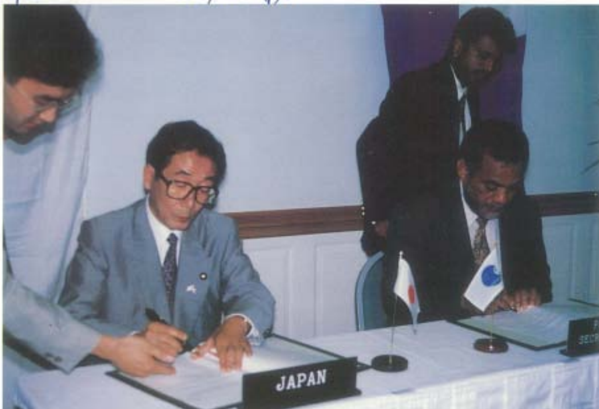
Japan's Parliamentary Vice Minister for Foreign Affairs, HE Hajime Ogawa & Secretary General Hon Ieremia Tabai at the Signing Ceremony in Majuro for the Pacific Islands Centre, Tokyo on October 1996.

The Pacific Islands Centre (officially known as the South Pacific Economic Exchange Support Centre) opened in Tokyo, Japan on 1 October 1996 following an agreement between the Government of Japan and the South Pacific Forum Secretariat at Majuro in September 1996. The Centre promotes trade and investment links between Japan and Forum island countries and encourages Japanese tourism to the region.