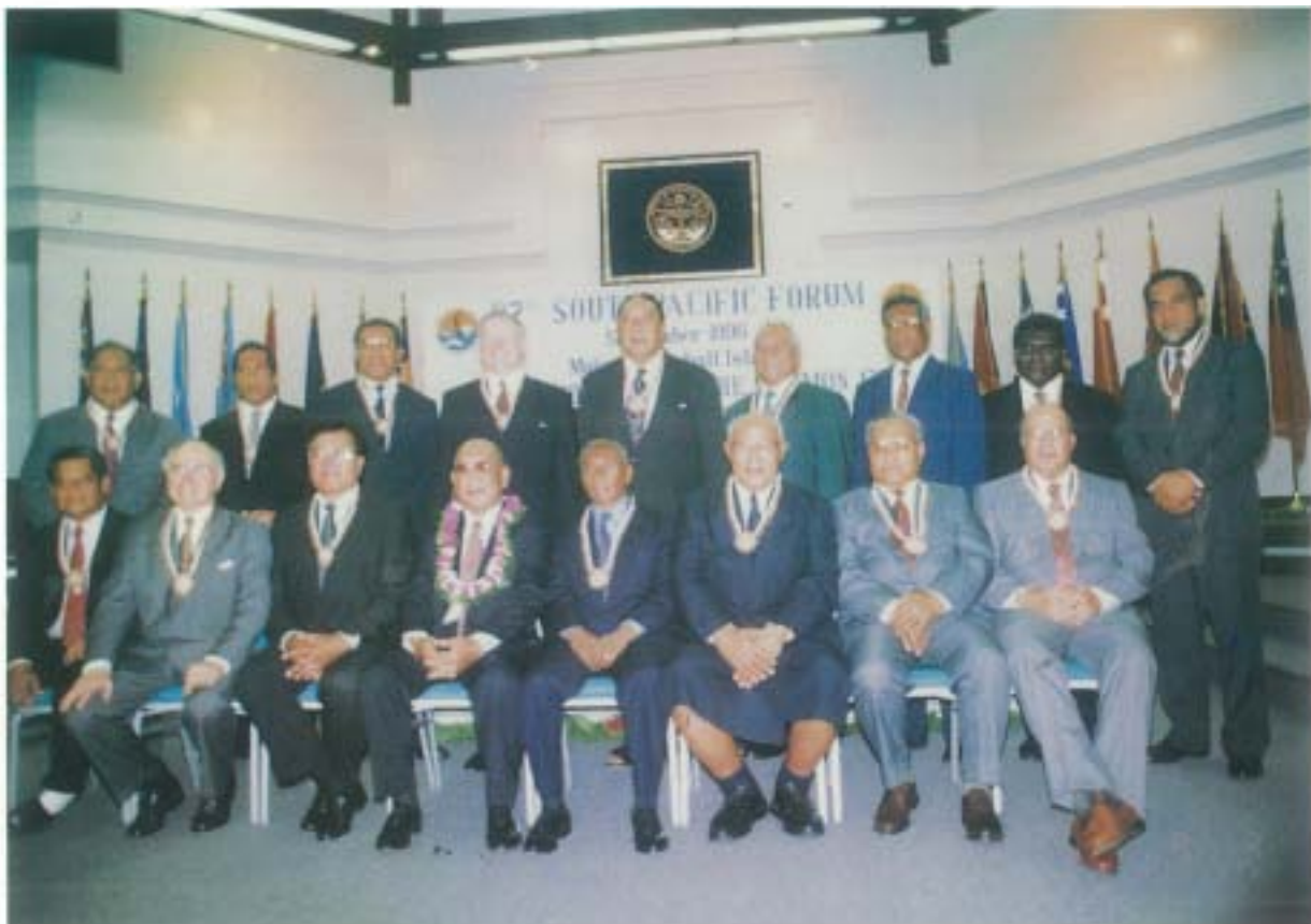
Pacific island leaders at the 1996 South Pacific Forum in Majuro, Republic of Marshall Islands.

The Division continues to promote and publicise the views of the South Pacific Forum on major issues affecting the region, as well as highlighting Secretariat programmes and activities. In addition to accessing traditional channels such as print and broadcast media, information is now being distributed through the Secretariat web site ( http://www.forumsec.org.fj ). The web site has helped related efforts to develop an electronic mail system that will reduce the amount of time and money used in the transmission of messages and documentation both locally and internationally. The Division also helps host Governments to coordinate media arrangements for the Forum and other important regional meetings.