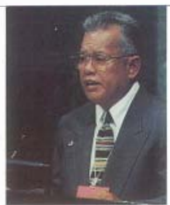
HE Imata Kabua, President of the Republic of Marshall Islands & Chairman of the South Pacific Forum addressing the UN.

The Division's new strategic role in coordinating sustainable development issues across key sectors and among regional organisations started to take shape during 1996/97. There was progress, under the Regional Strategy, in efforts to establish a system for identifying and advocating a set of coherent regional