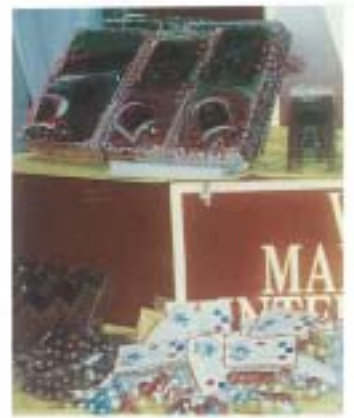
Processed foods by Willex Marketing in Suva.

In the case of the second phase of the Canadian South Pacific Ocean Development Programme, Division staff assisted other regional agencies to maximise private sector involvement in the