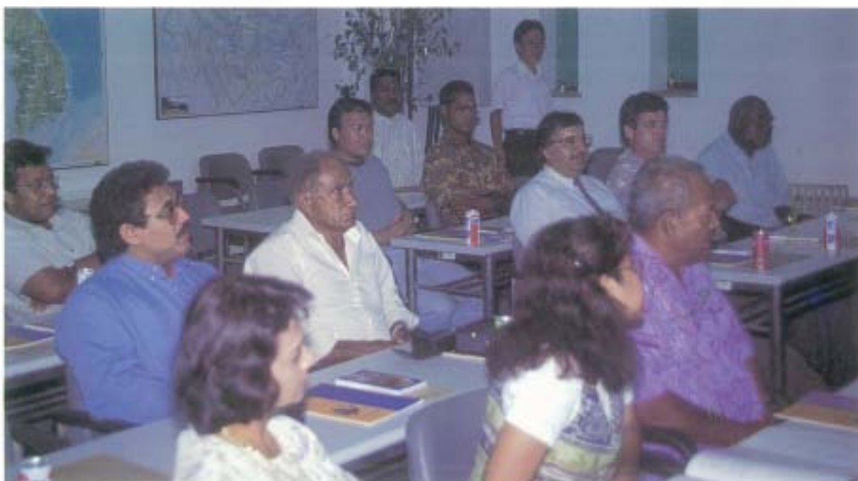
Pacific participants at a Trade & Investment seminar in Seoul, Korea.

A second edition of the South Pacific Trade Directory has been published. A development programme matrix summarises current donor and regional agency programmes that focus on private sector development. This information is useful to avoid duplication in regional programming activities, identify gaps in existing programmes and suggest areas for future cooperation. The Trade Forum newsletter continues to provide a wide range of information on activities, opportunities and events covered by the Division.