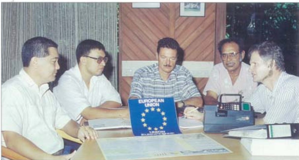
A meeting on PREP activities in Suva.

Both Australia and New Zealand sought evidence of the value of the core (non-EU funded) programme before making commitments to support regional energy activities beyond 1997. New Zealand commissioned consultants to undertake an independent review and a report was due in August.